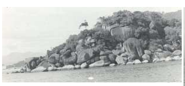
Rock Island Point Vietnam