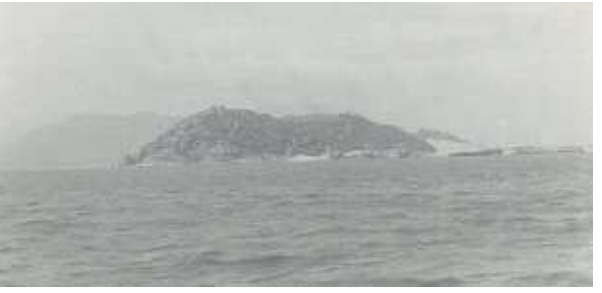
The Rock Vietnam 1967next right port of Cam Ranh