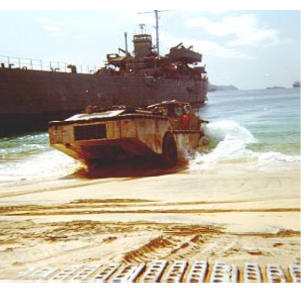
A new definition to the phrase 'rid hard and put away wet' (347th Trans (LA) on South Beach, Cam Ranh Bay)