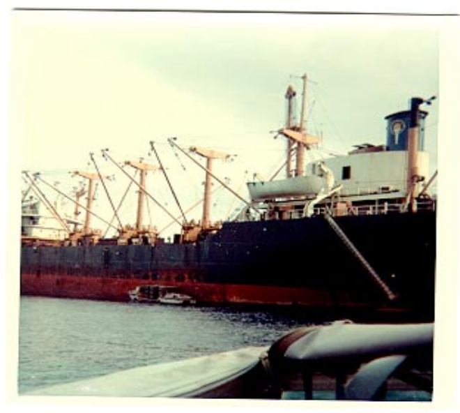
Napalm loading from the SS Our Lady of Peace (Cam Ranh Bay, 12/66 - 347th LARC)