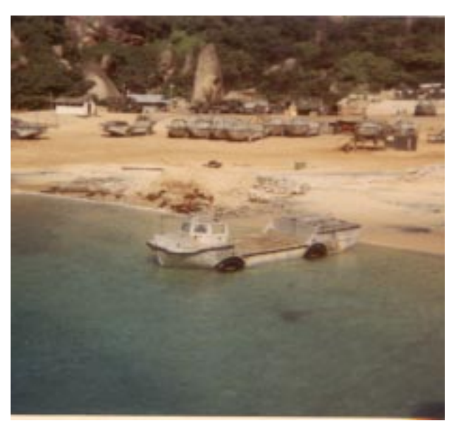
347th LARC's waiting a mission in CRB 11/66... (More likely waiting for parts)