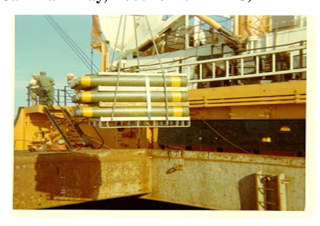
Our 'bread and butter', napalm and bombs for the Cam Ranh Air Force Base before the Ammunition Pier was openned at CRB.