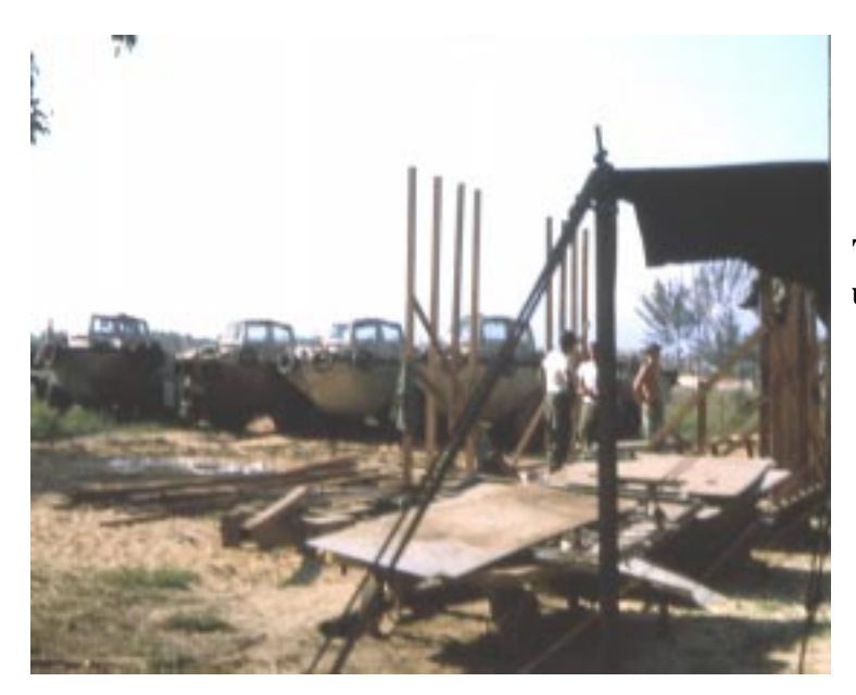
The 344th Trans Co\left(LA\right) company area under construction in DaNang