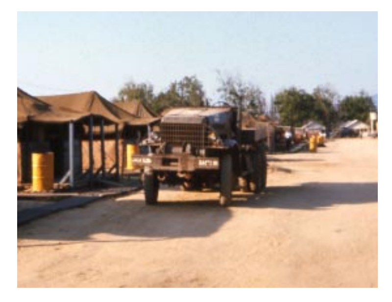
The finished product 344th Trans Co