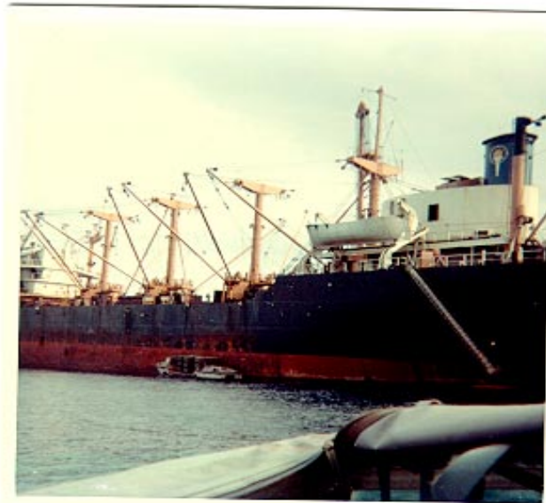
Napalm loading from the SS Our Lady of Peace (Cam Ranh Bay, 12/66 - 347th LARC)