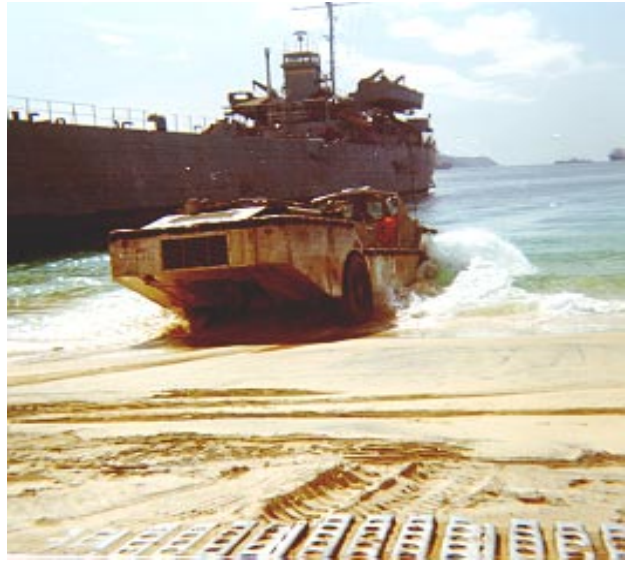
A new definition to the phrase 'rid hard and put away wet' (347th Trans (LA) on South Beach, Cam Ranh Bay)