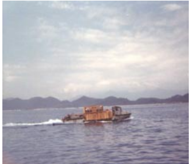
Our 'bread and butter', napalm and bombs for the Cam Ranh Air Force Base before the Ammunition Pier was opened at CRB.