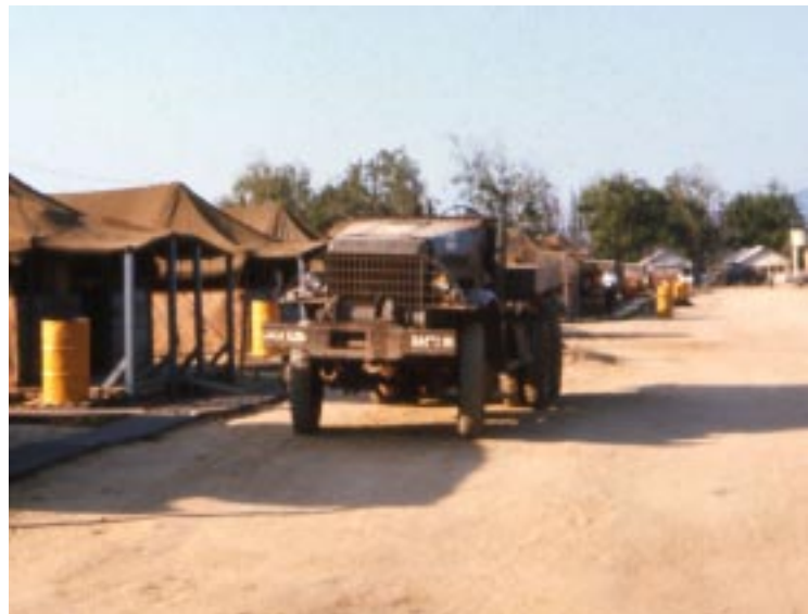
The finished product 344th Trans Co