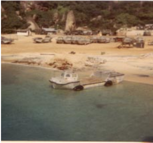
347th LARC's waiting a mission in CRB 11/66... (More likely waiting for parts)