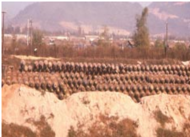
The 344th hauled a lot of bombs for the Air Force in DaNang in '65 & '66.