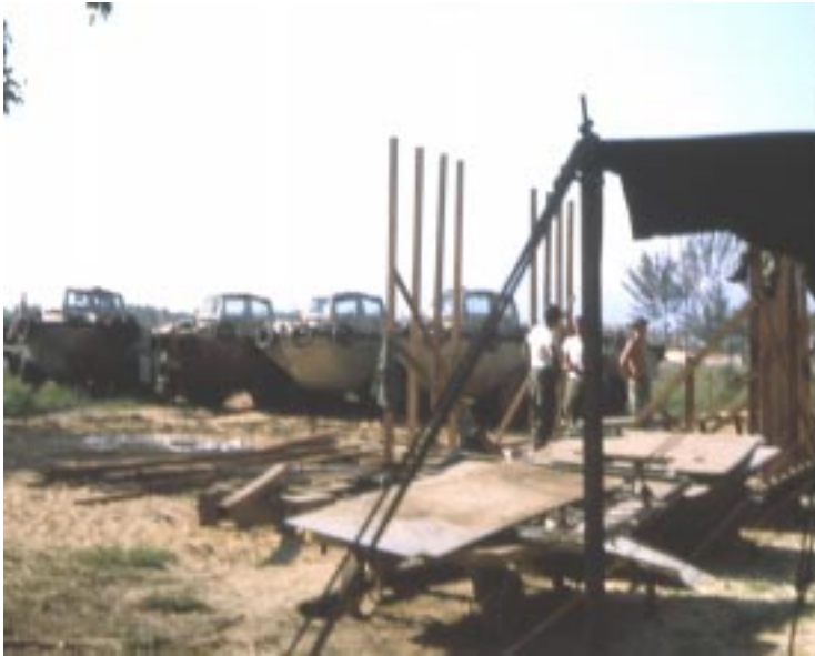
The 344th Trans Co (LA) company area under construction in DaNang